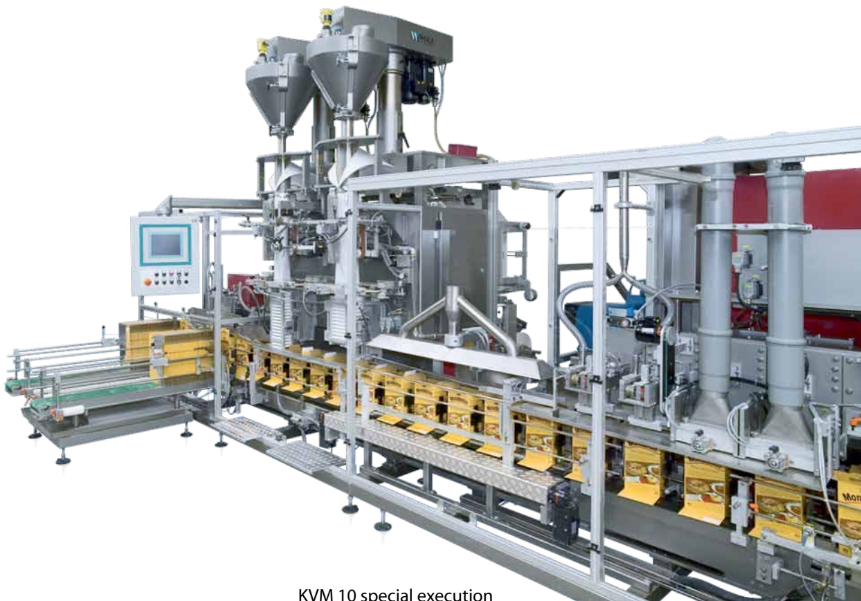
KVM 10 special execution