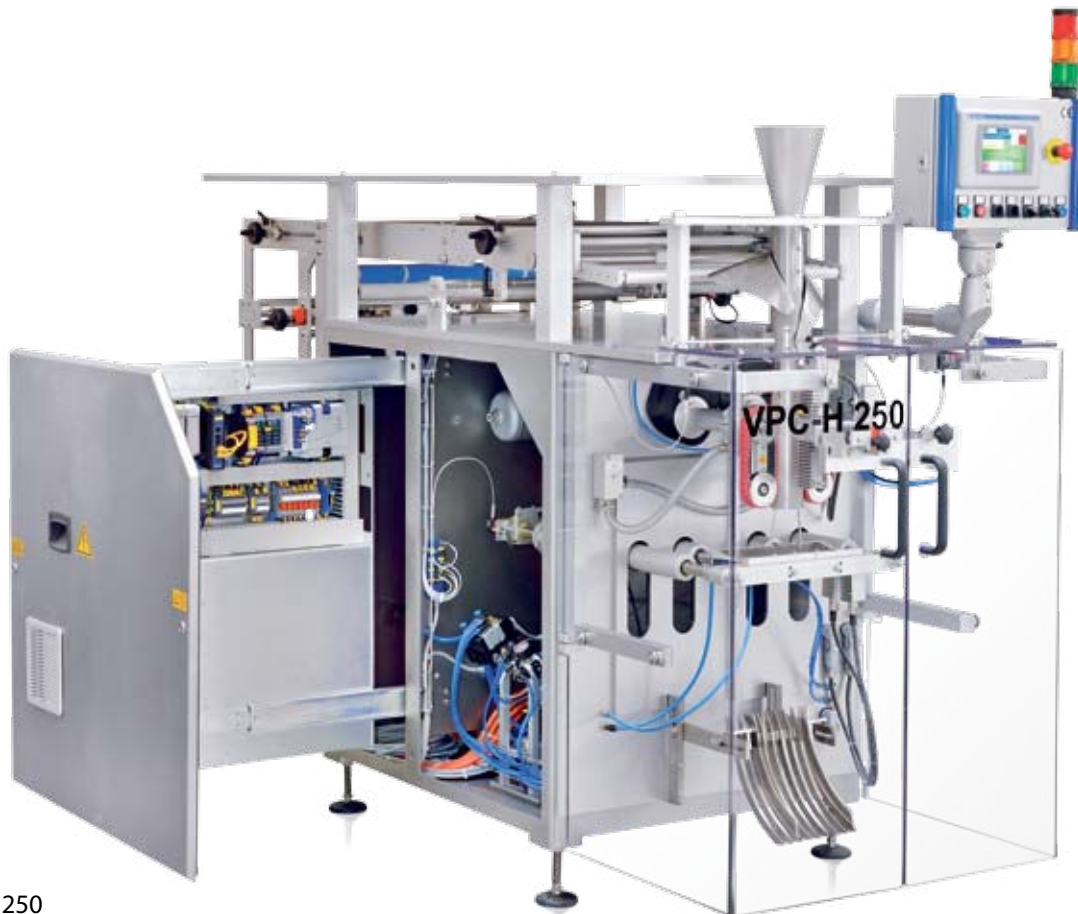
VPC-H 250 with electric control cabinet, accessible through a sliding mechanism