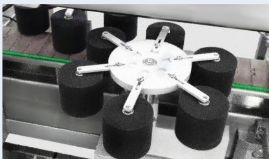
• 5-panel wrap station. (option)