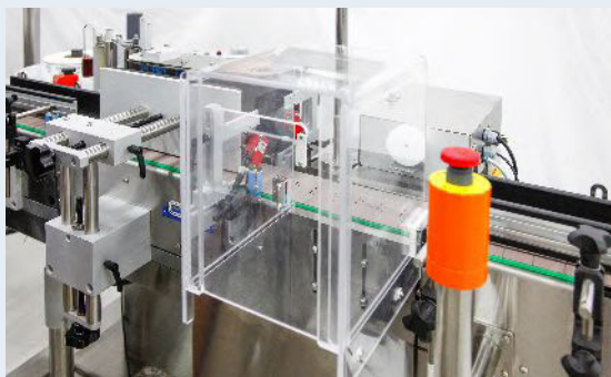
• Reject system. (option)