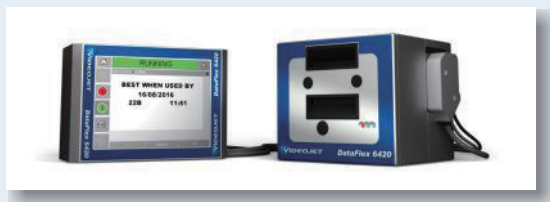
THERMAL TRANSFER PRINTER